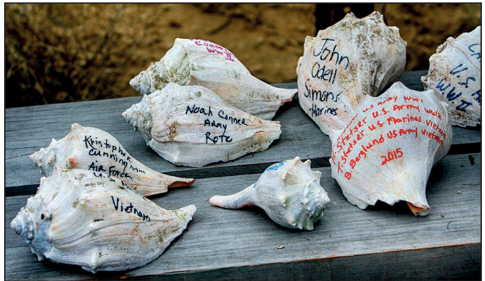
Event attendees honored military veterans by inscribing the person's name on a shell, which was later placed on Veteran's Reef.

The dedication ceremony recognized all US military veterans and highlighted those veterans who had direct involvement in the effort to restore New Jersey's Delaware Bayshore. Much of the work on the reef, which was built to help preserve habitat important to both horseshoe crabs and migrating shorebirds, was