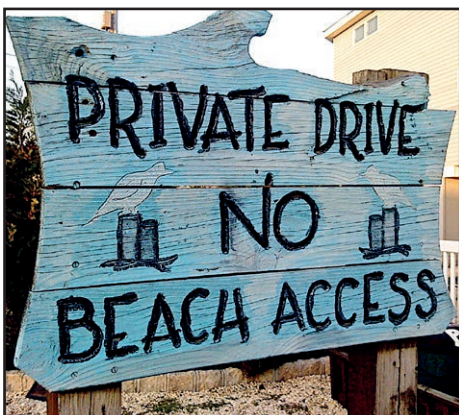
A recent court decision eliminated protections for public access to beaches and waterfront in New Jersey.

With the beginning of spring many start to plan for spending time on the water. In New Jersey, that is sometimes easier said than done, especially since a court decision in December 2015 threw out the state's public access regulations.