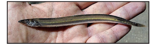
American sand lance

It became obvious to us that this fish is well known to many fish enthusiasts, given the large amount of correct responses that we received. We vow